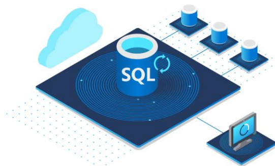
Fig 3 SQL Database

Database normalization is the process of restructuring a relational database in accordance with a series of so-called normal forms in order to reduce data redundancy and improve data integrity. Normalization entails organizing the columns (attributes) and tables (relations) of a database to ensure that their dependencies are properly enforced by database integrity constraints. It is accomplished by applying some formal rules either by a process of synthesis (creating a new database design) or decomposition (improving an existing database design).”