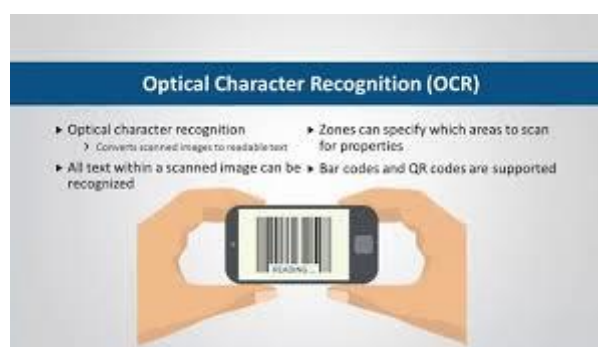
Fig 4 Optical Character Recognition (OCR)

OCR enables to convert previously prints text material into information .OCR requires a scanner and software .The basic process of OCR involves examining the test a document and translating the character into code that can be used for data processing .It is also referred to as text recognition OC R is using a scanner to process the physical form of a document .OCR software converts the document into two color or black and white version. The application of OCR is for automatic data entry, extraction processing and recognizing text such license plates with a camera or software.