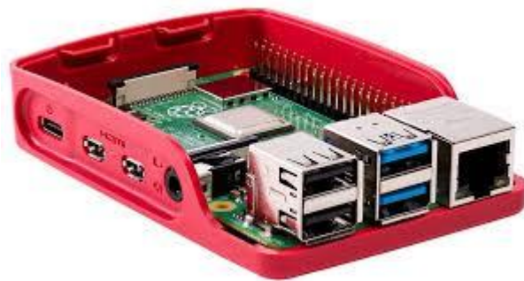
Fig 2 Raspberry pi

Here we are using syper python software to implement a program in order to store and access the data of the visitors and the hardware Raspberry pi is used. The Raspberry pi is a low cost, credit- card sized computer that plugs into a computer monitor or TV, and uses a standard keyboard and mouse. It is capable little device that enables people of all ages to explore computing, and to learn to program in languages. An SD card inserted into the slot on the board acts as the hard drive for the Raspberry pi. It is powered by USB and the video output can be hooked up to a traditional RCA TV set, a more modern monitor ,or even a TV using the HDMI port widely uses such as for weather monitoring because of its low cost, modularity and open design .